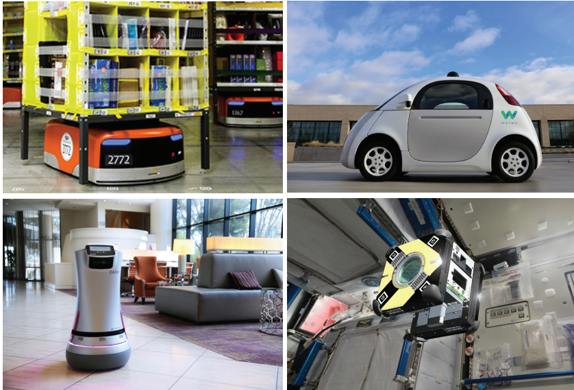
Figure 1.1: Non-humanoid robots, such as the Amazon warehouse robot, Waymo autonomous car, Savioke Relay, and NASA Astrobe (clockwise), are being regularly deployed and must use nonverbal signals to interact with co-located humans.

2013, Forlizzi and DiSalvo, 2006, Kittmann et al., 2015, Urmson et al., 2008, Wurman et al., 2008].